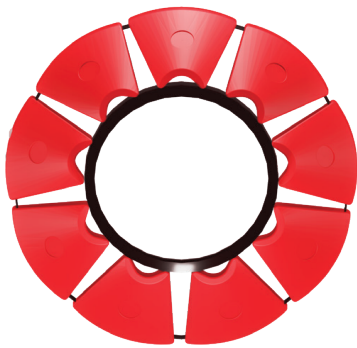
26 inch pipe 9 float units