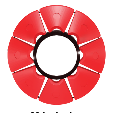
20 inch pipe 8 float units