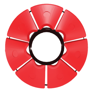
14 inch pipe 7 float units